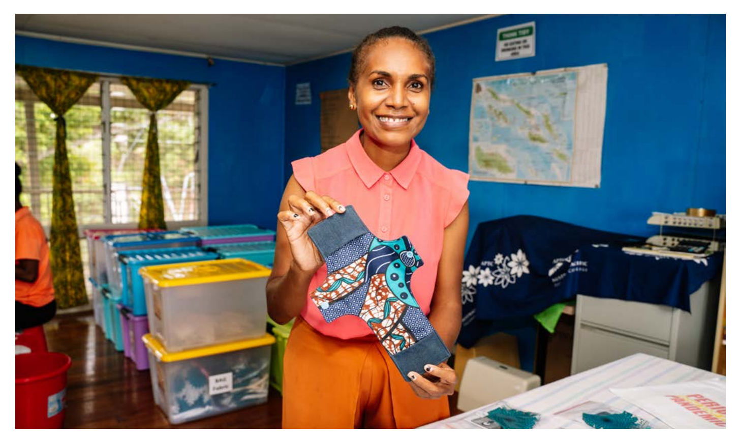
The founder of MJ Enterprise - now known as Kaleko Steifree - presents one of their locally made menstrual pads, which can be reused for two to three years

Customs, beliefs, taboos and shame associated with menstruation remain key challenges. If schools lack separate toilets for girls or toilets have no locks, managing menstruation in schools is difficult (SNV Lao PDR). The cost of sanitary pads in rural areas, and sometimes in urban areas, complicates MHH (HfH Fiji). Shame is a key reason why women and girls prefer not to wash and dry reusable sanitary cloths in public places; girls often lack information on MHH (IRC, Pakistan), and female teachers are uncomfortable in teaching the topic (Pakistan, Bangladesh). World Vision in Vanuatu report that 29% of women with disabilities and 18% of women without disabilities in Sanma and Torba Provinces miss social activities when they menstruate? In Fiji, teachers from Naviti Primary School collaborated with Sunday School teachers to deliver consistent and positive MHH messages. This seems an effective partnership and a great way to make progress on a sensitive topic.