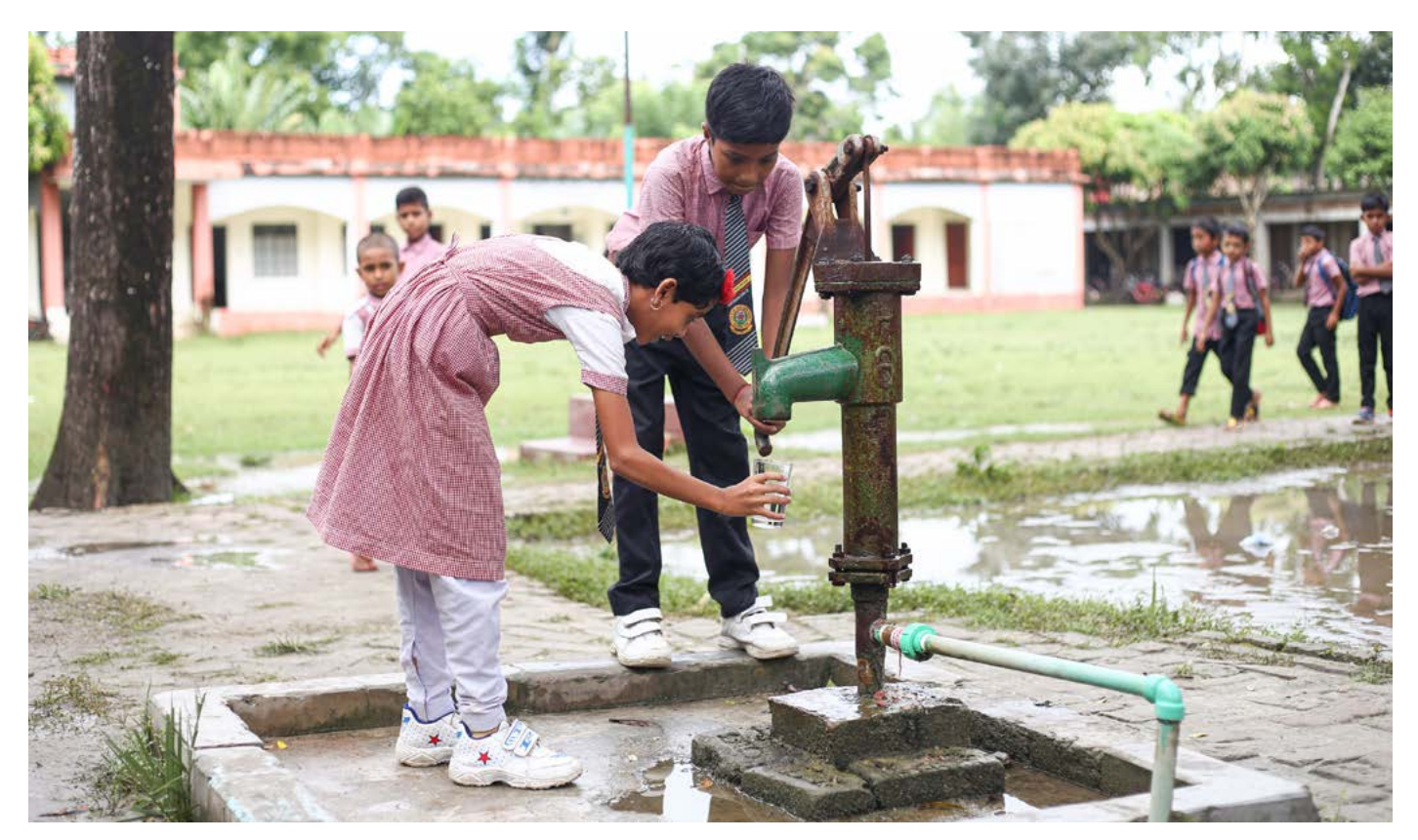
At a primary school in Satkhira district, Bangladesh, students access drinking water from a hand pump installed by World Vision

The education sector plays a very important role in strengthening WASH in Schools collaboration and synergies.