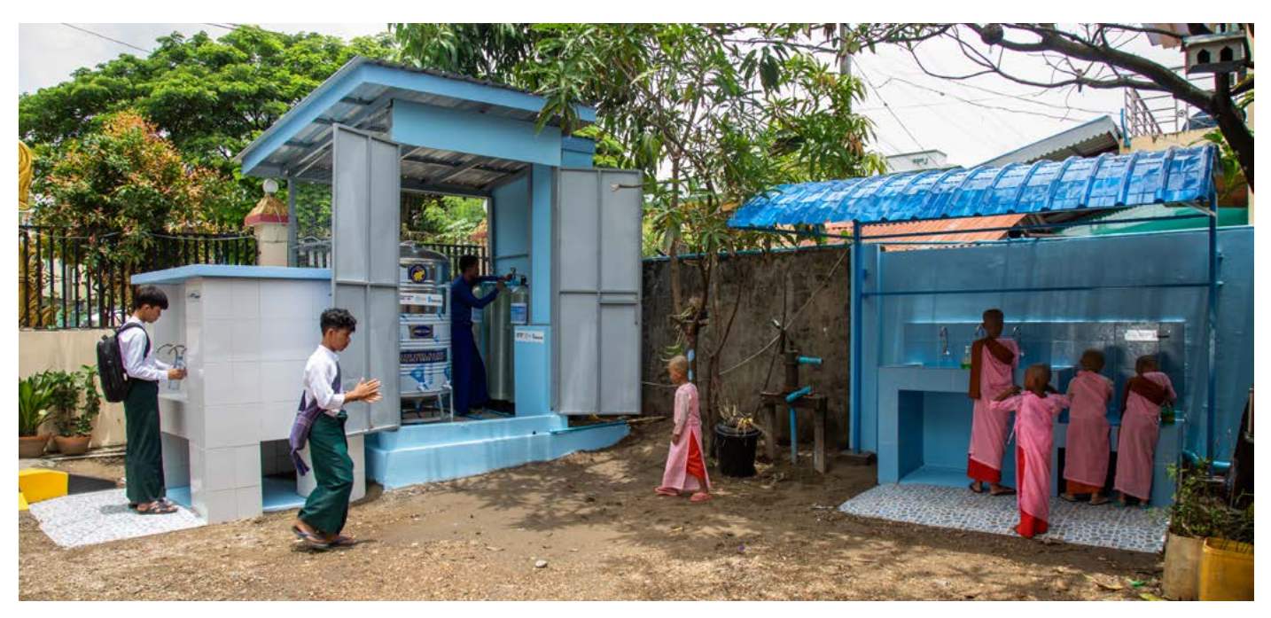
Students at a community-run school in Myanmar access handwashing facilities and water drinking stations installed by WaterAid as part of the <u>Myanmar</u> <u>Humanitarian WASH project</u>

There is scarce private sector funding (e.g. concessional financing/loans, public-private partnerships, development impact bonds) or other innovative financing mechanisms available for rural WinS in Water for Women projects, perhaps due to remote rural locations of projects, high cost of WinS, logistical challenges, and poverty of the population.